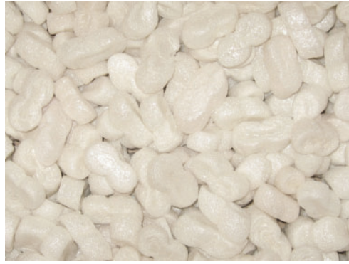
VOC Reading Of Packing Material

A recent study conducted in an office environment exposed the increasing levels of Volatile Organic Compounds (VOCs) that are released through normal daily functions. An E Instruments AQ VOC, Indoor Air Quality Monitor was used to measure the VOC readings in an ordinary shipping and receiving room. The monitor was used to measure the various VOC compounds released into the breathable air as a result of the usage of packing material. The graph below displays and proves the accuracy the unit holds. The beginning of the test (labeled by point A) captures the higher levels of VOCs released from the opening of a bag packing peanuts. The monitor was able to capture the VOC readings rising toward levels of 4,000-6,000 parts per billion. The monitor was then brought outdoors to clean ambient air (at point B) where the VOC levels quickly dropped, and the readings reflected the new cleaner environment.