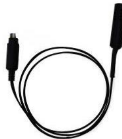
Figure 3 TRH-EXT (Optional)