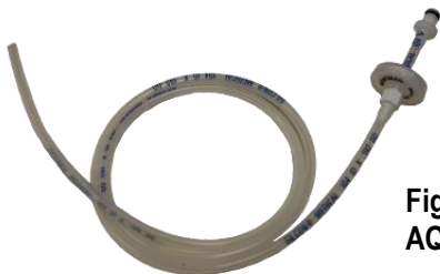
Figure 2 AQ650078 (Included)