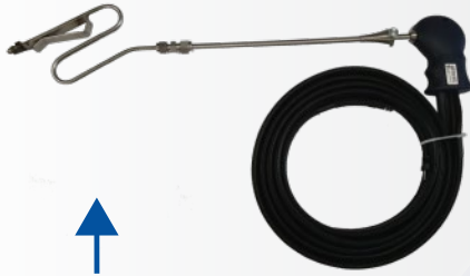
S-Type Probe Fitting & Exhaust Clamp