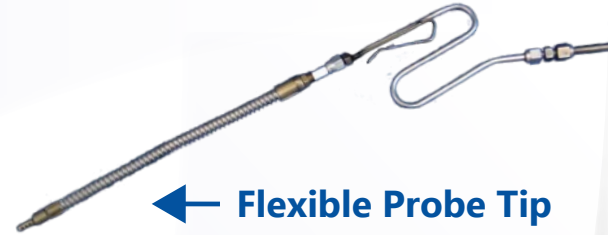
Flexible Probe Tip